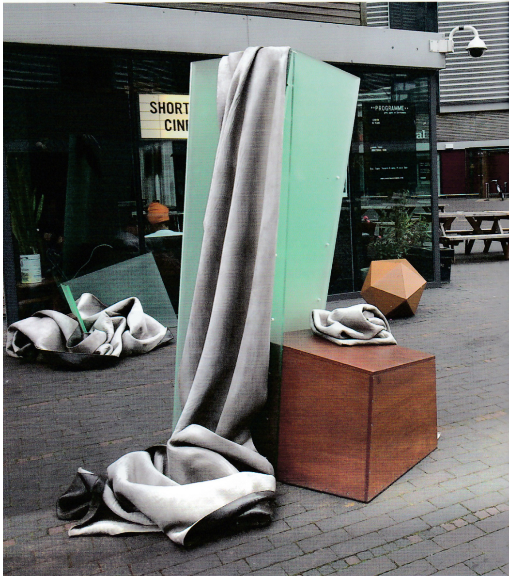
Loss of object and bondage to it Fig. 2, 2015 – Bermondsey Square