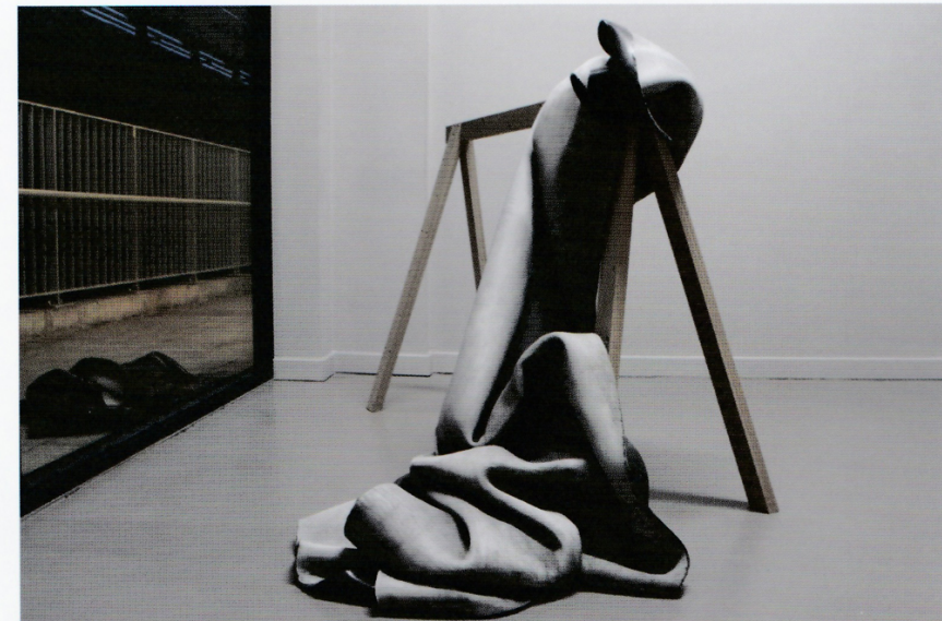
Loss of object and bondage to it 2014 – Lubomorov-Easton, Deptford.