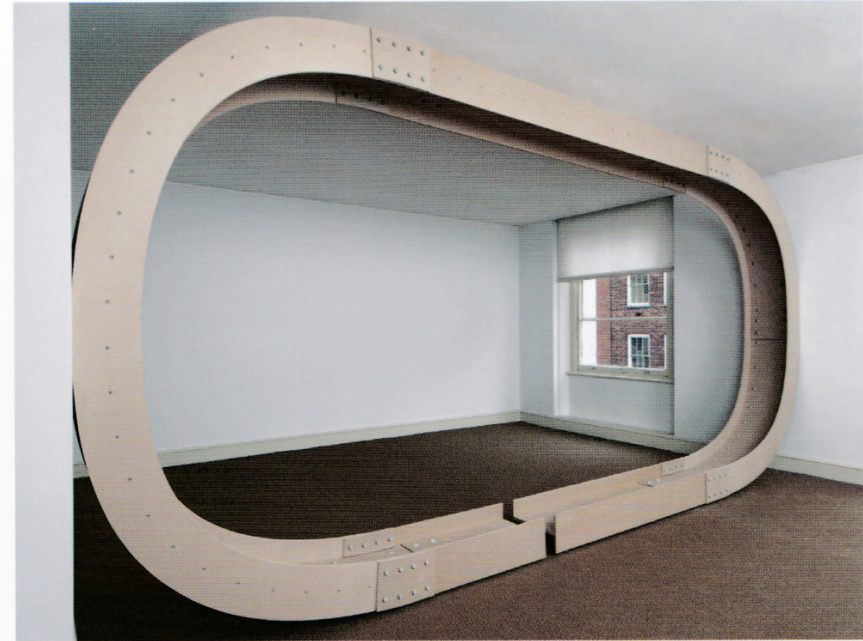
i-Beam to walk through , 2011